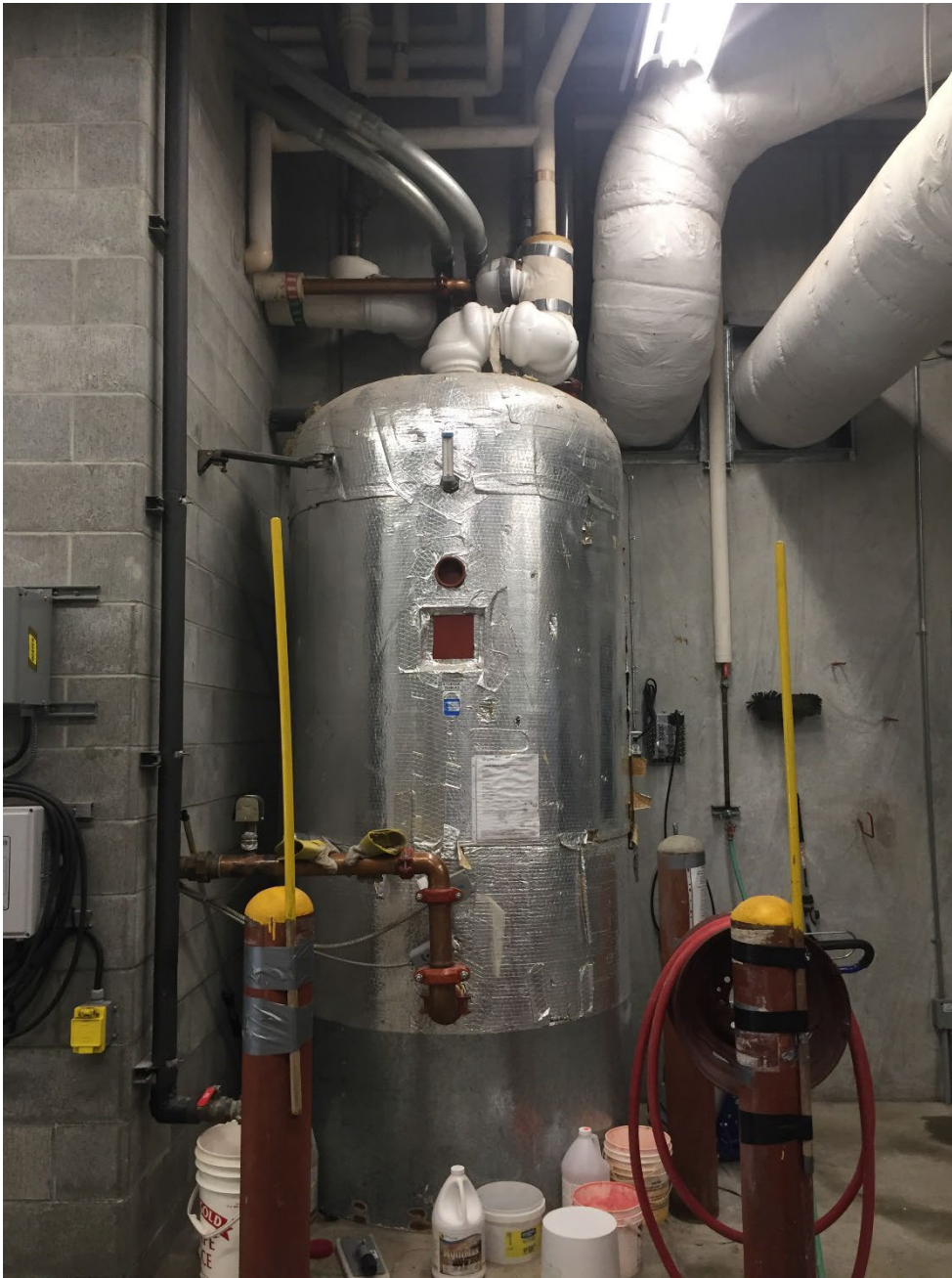
Boiler hot water storage tank