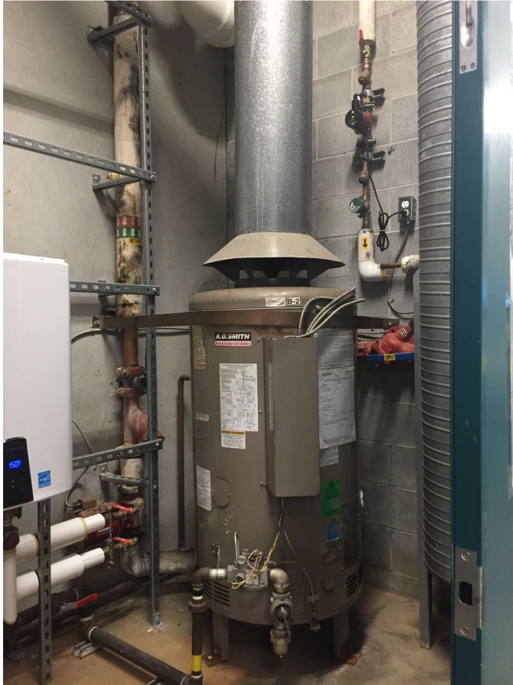
Current A.O. Smith boiler