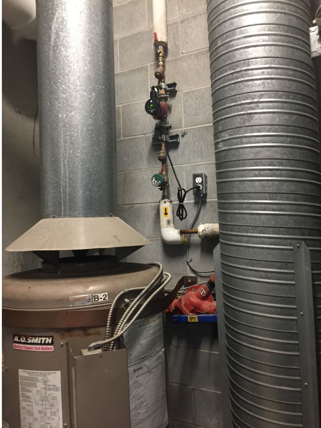
A.O. Smith Boiler labels